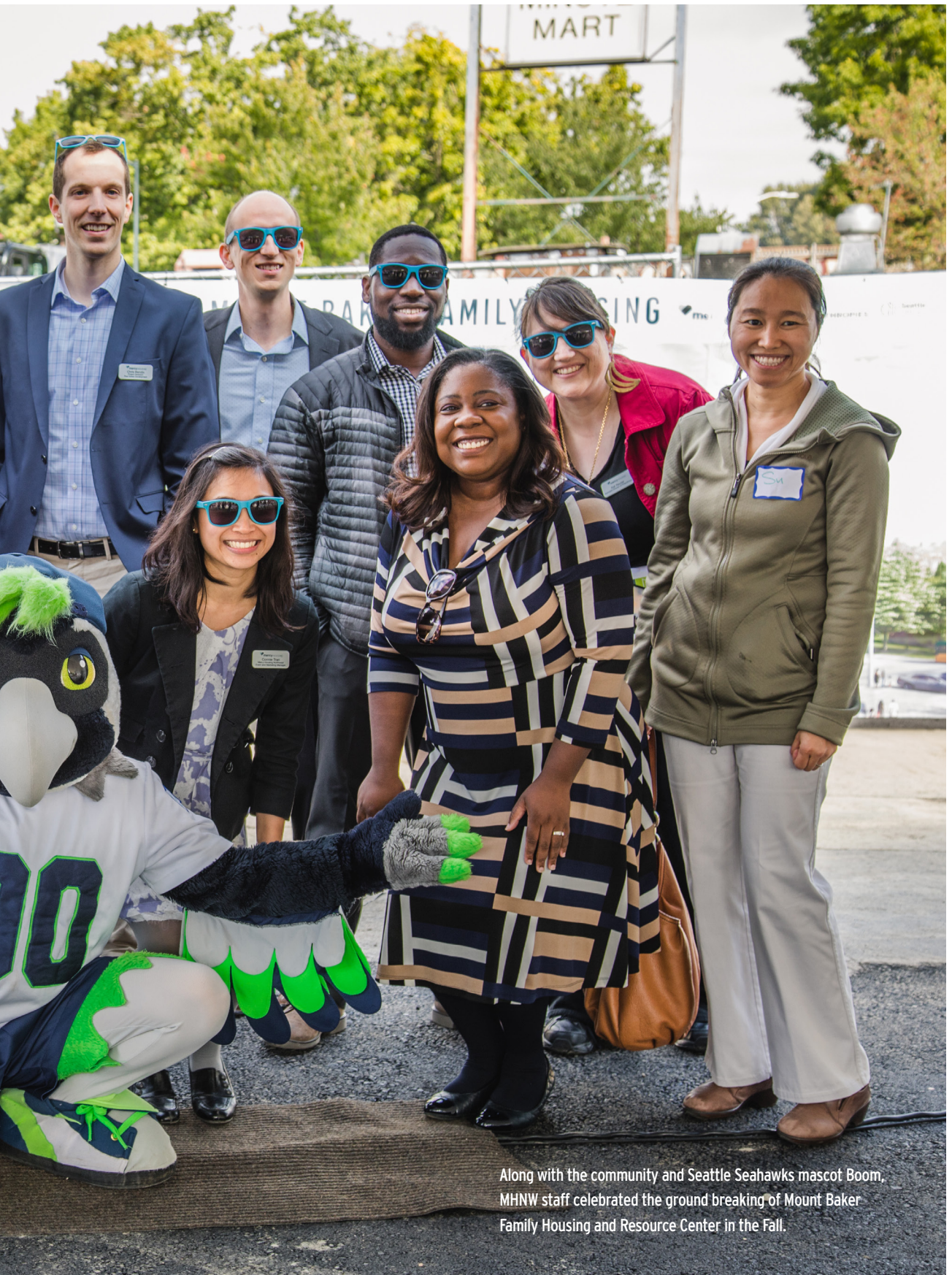
Along with the community and Seattle Seahawks mascot Boom, MHNW staff celebrated the ground breaking of Mount Baker Family Housing and Resource Center in the Fall.